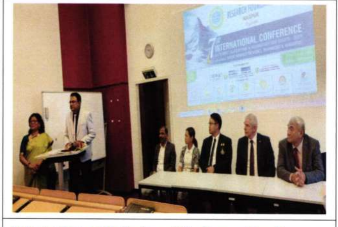
Interaction with Juries while Presenting Paper