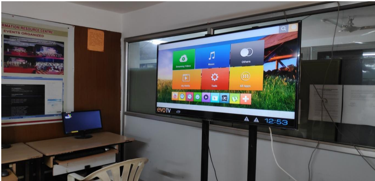
48 inches LCD TV for watching documentaries and educational films on Internet.