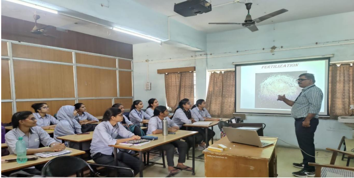
UG & PG classrooms are well equipped with ICT media LCD projectors.