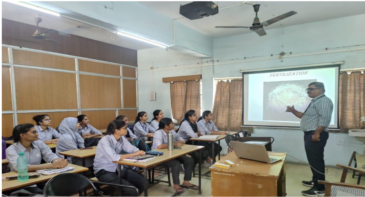
UG & PG classrooms are well equipped with ICT media LCD projectors.