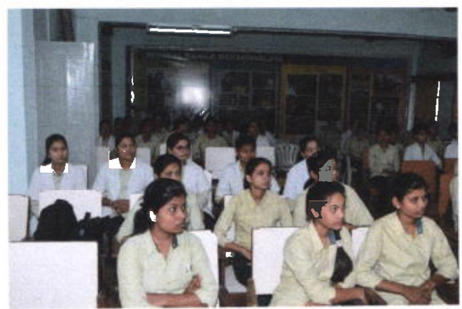
Students Attended Seminar