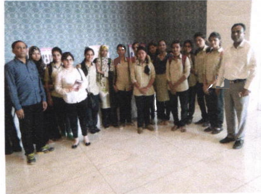
Students of UG and PG of Different Faculty attended the Programme on Rozgar Mela At Ganga Kashi Hotel, Nagpur.