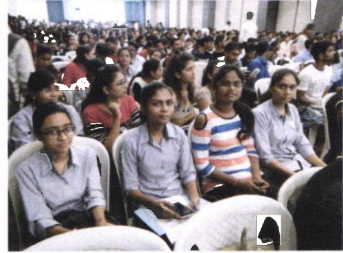
Students of UG and PG of Different Faculty attended the Programme on Rozgar Mela At Ganga Kashi Hotel, Nagpur.