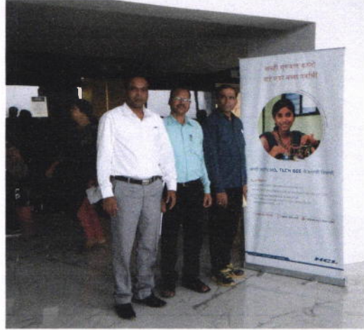
Faculty attended the Programme on Rozgar Mela At Ganga Kashi Hotel, Nagpur.