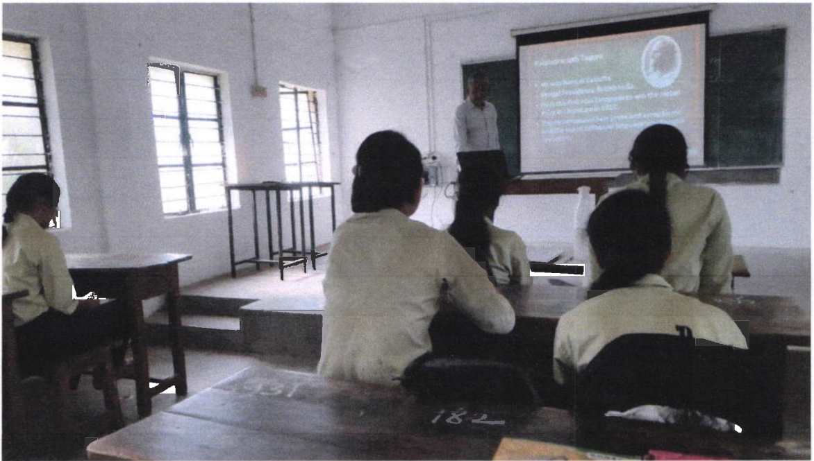
UG & PG classrooms and laboratories are well equipped with ICT media LCD projectors.