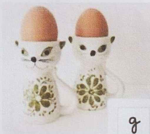
Photoes of Ceramics Arts