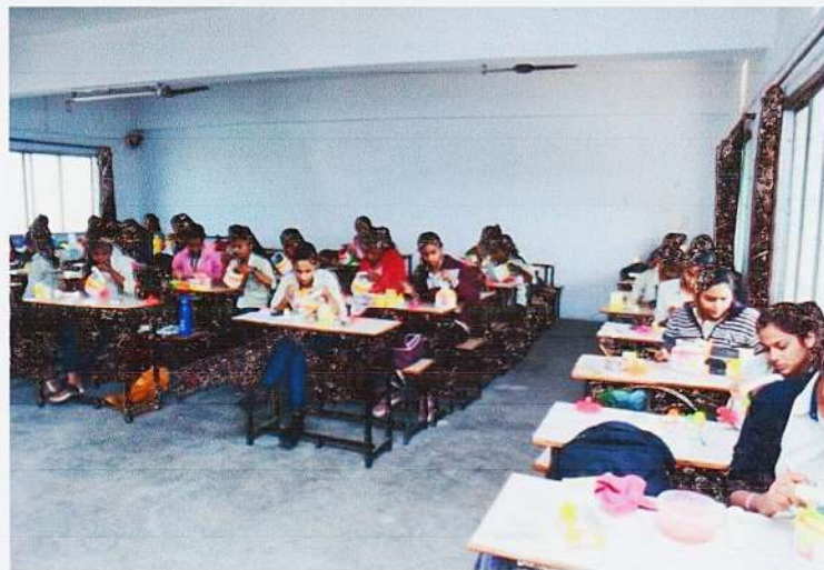
STUDENTS ENGAGE IN WORKSHOP