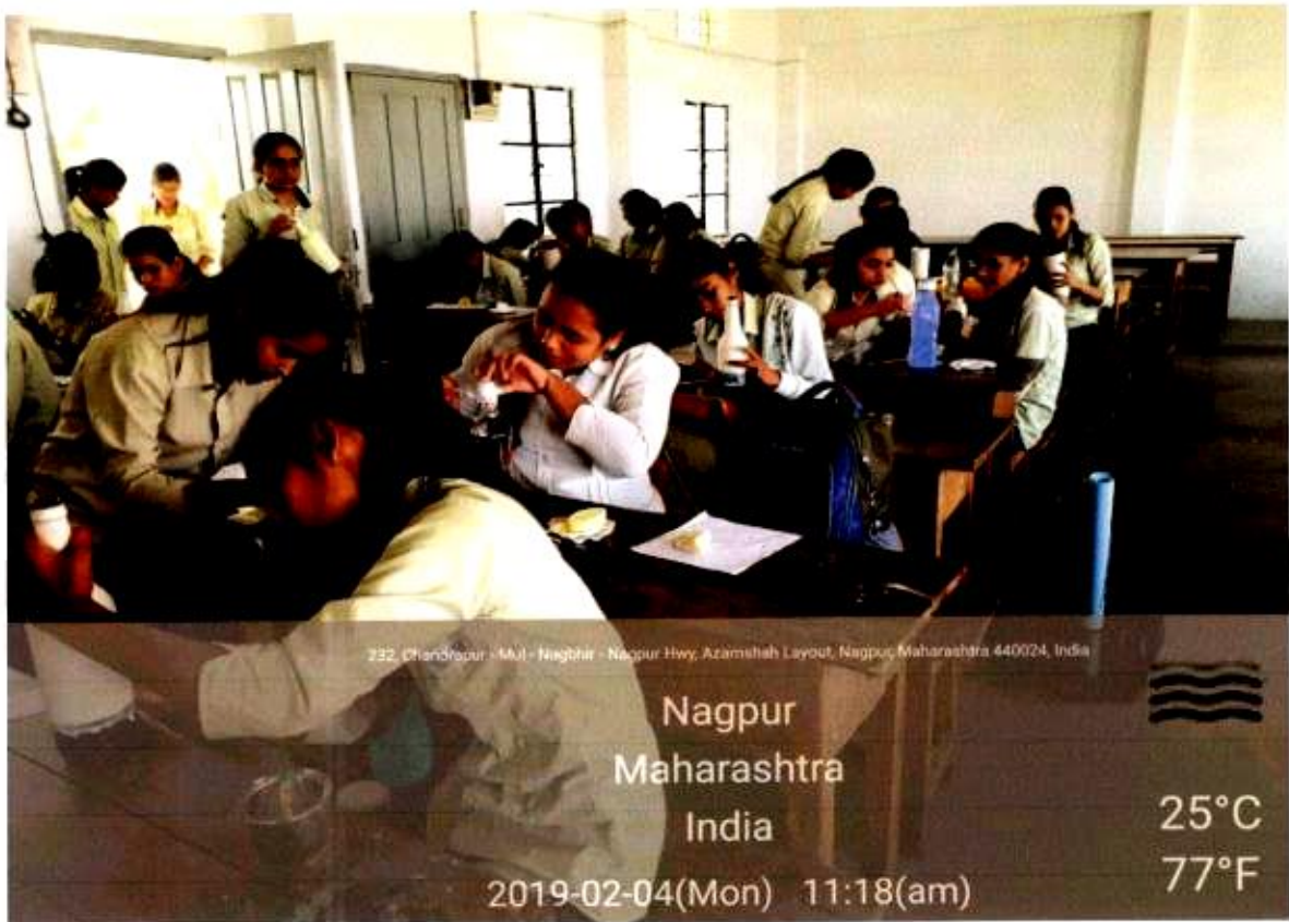
Students engage in workshop