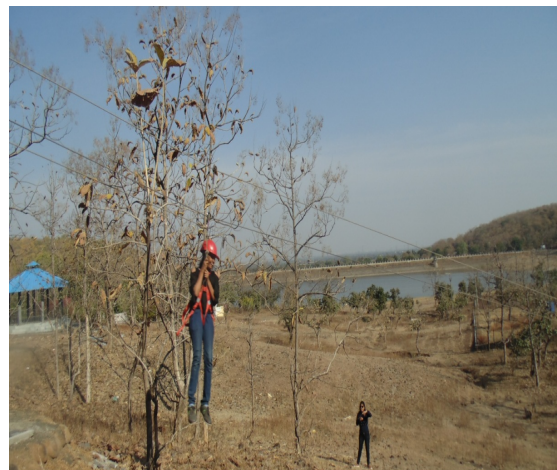
All smiles after successfully completing the task of rope way at Maitraban Adventure Camp Adventure Camp