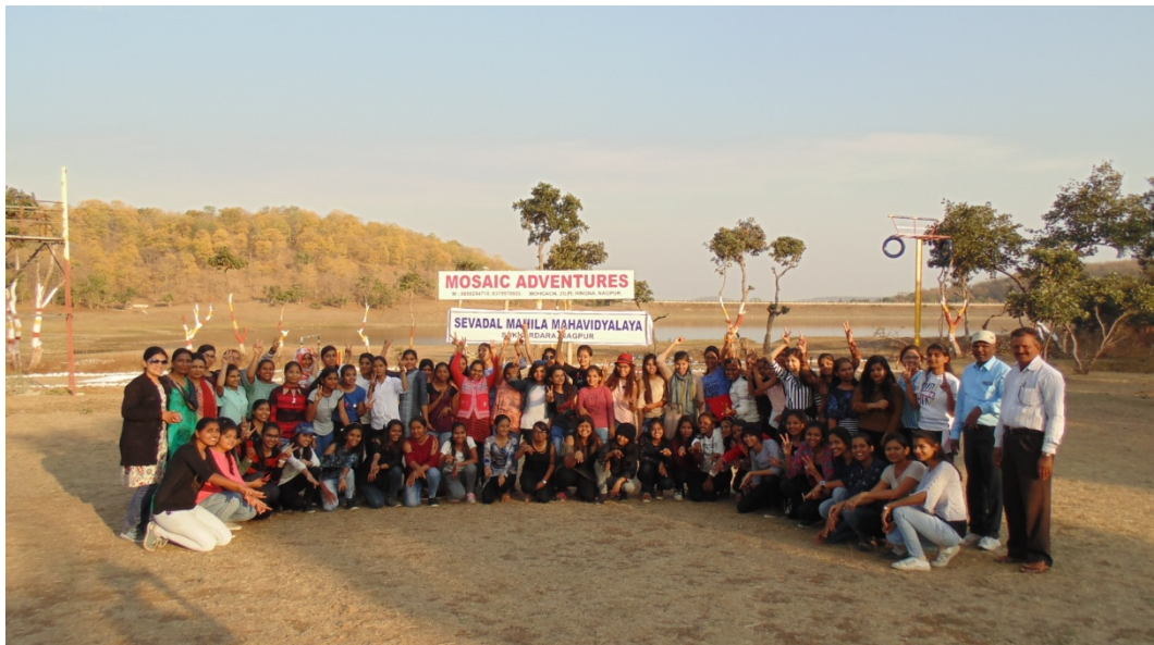
Complete Team of Students of B. Sc.-I year (SEM II) at Maitraban Adventure Camp Adventure Camp along with staff.