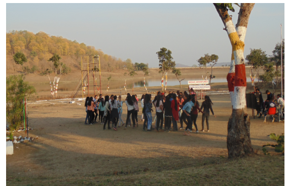
Students danced on the music at Maitraban Adventure Camp Adventure Camp