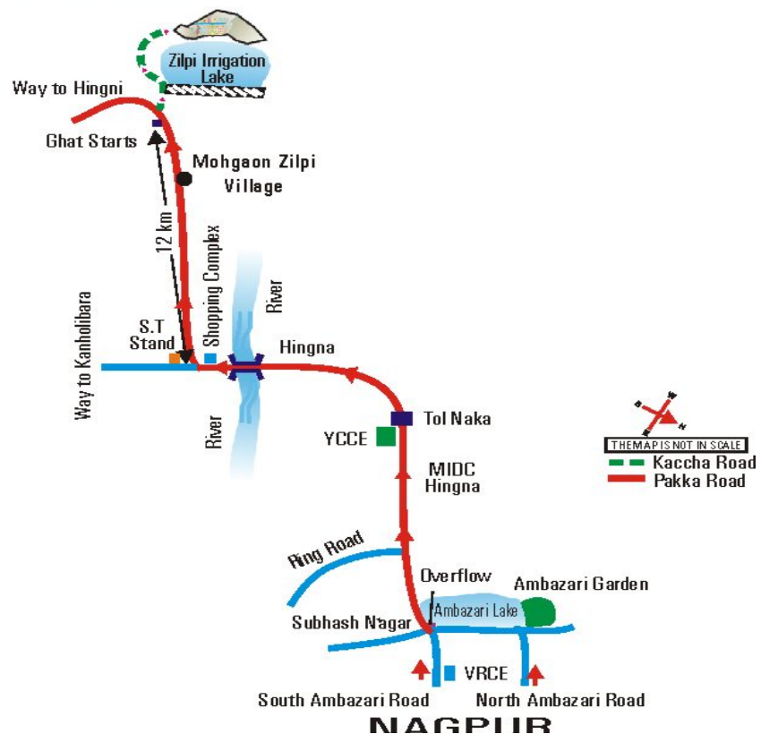
Location map of Maitraban Adventure Camp, Mohgaon Zilpi, Hingna, District Nagpur, Maharashtra

The educational tour was successful as student learned new avenues in the field of adventure that are useful in overall development of the students.