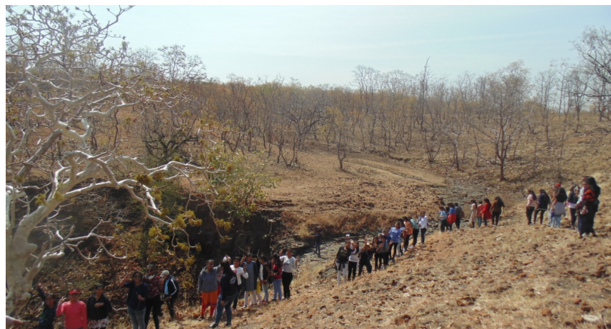
Students performing valley crossing Maitraban Adventure Camp Adventure Camp