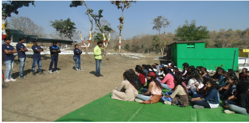
Students at Maitraban Adventure Camp Adventure Camp