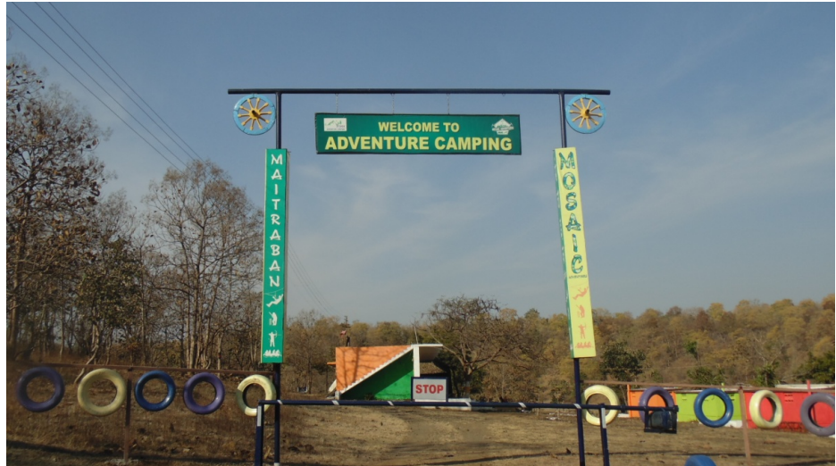
Entrance Gate of Maitraban Adventure Camp, Mohgaon Zilpi, Hingna, District Nagpur, Maharashtra