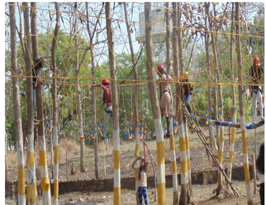
Students testing their ability to cross Burma bridge