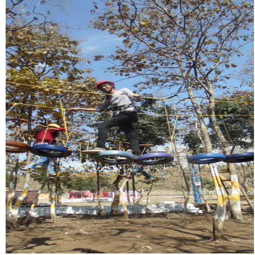
Students testing their ability to cross ladder bridge