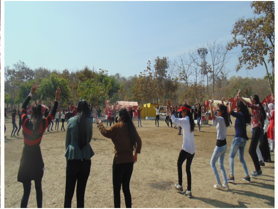
Students testing their ability to compete in one of the fun games at Maitraban Adventure Camp Adventure Camp