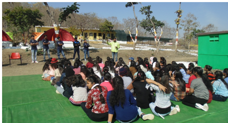
Commando of Maitraban Adventure Camp Adventure Camp guiding the Students of before performing different adventurous activities