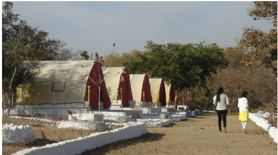
Tents allotted to the students at Maitraban Adventure Camp, Mohgaon Zilpi, District Nagpur, Maharashtra