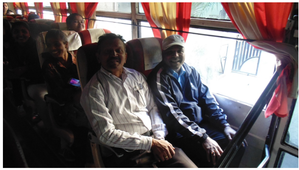
Students of B. Sc.-I year (Sem II) Microbiology assembled along with teachers in the bus for their adventure tour to Maitraban Adventure Camp, Mohgaon Zilpi, District Nagpur, Maharashtra