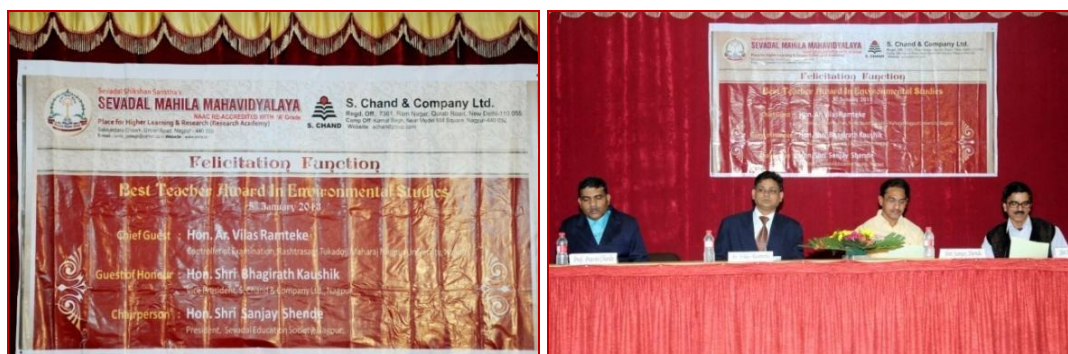
Felicitation Function Best Teacher Award – 2012