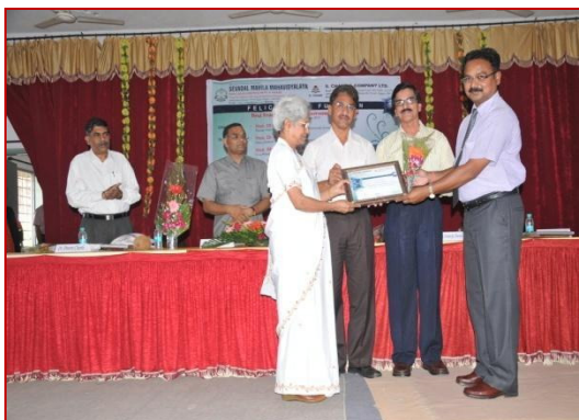
'Best Teacher Award' being given by the dignitaries.