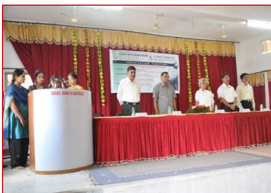
Students reciting R.T.M.N.U. Vidyapeeth Geet