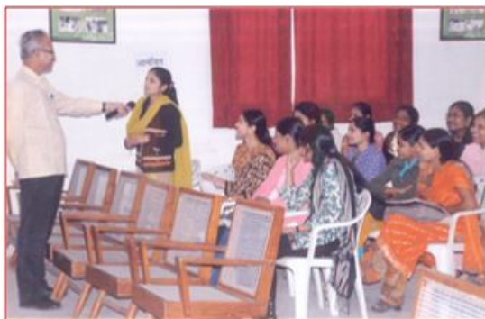
Participants presenting their views during the session

This session was very informative and all the participants responded very enthusiastically and positively.