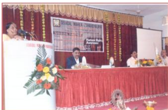
Hon'ble Godse Madam delivering the inaugural speech