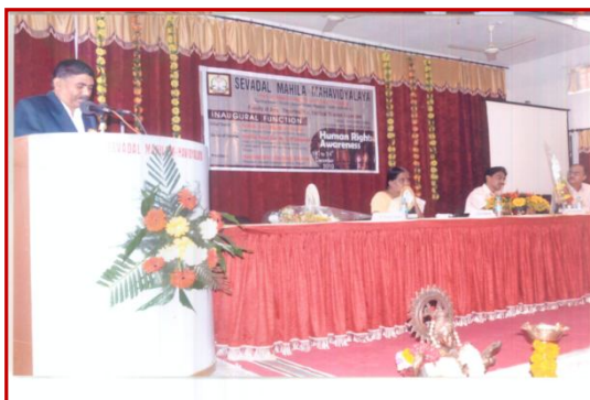
Hon'ble Principal presenting welcome speech