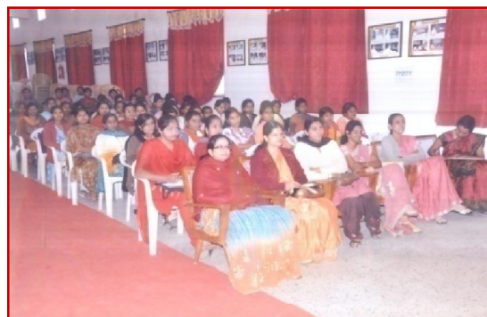
Audience during the session