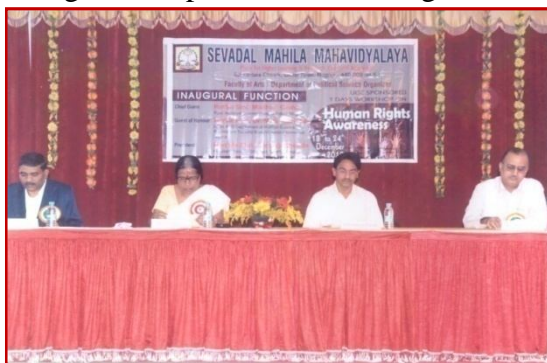
Hon'ble Dignitaries on the dais