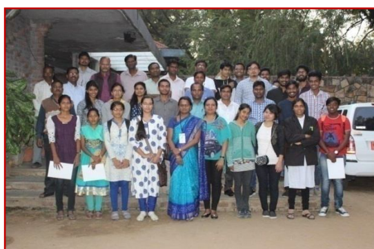
Participants in the workshop