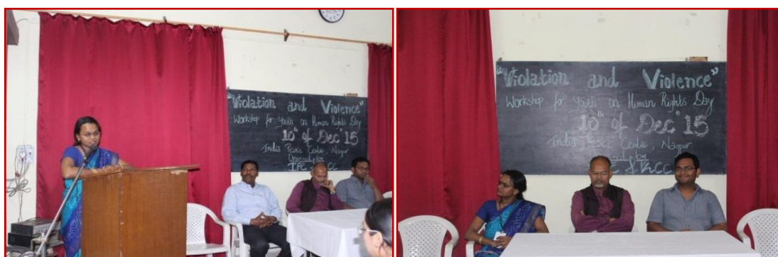
Presenting view on the occasion of Human Rights Day