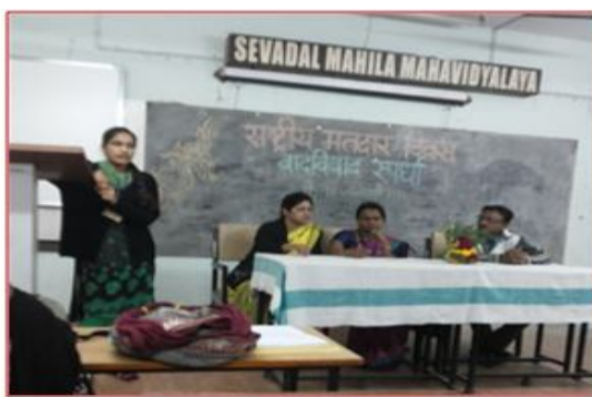
Participant in Debate Competition