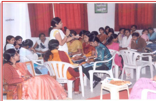
Students presenting their views in Group Discussion